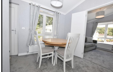
Pitch Fee approx £240 per month Subject to Annual Review Council Tax Band: 'A' Tenu